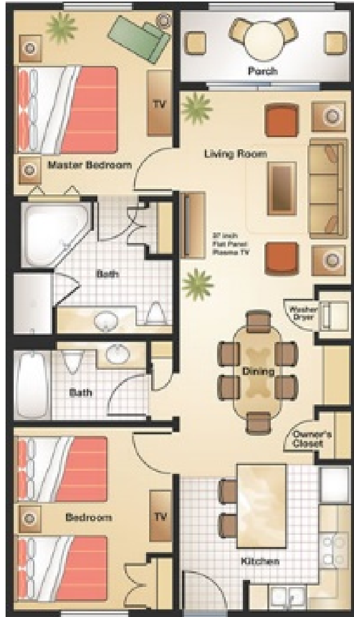
Inside what a Typical Resort Rental might look like.